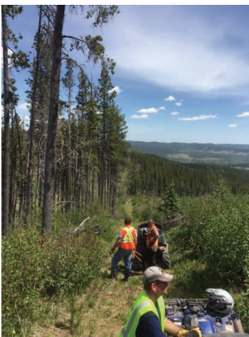
Clearing a path for the reroute.