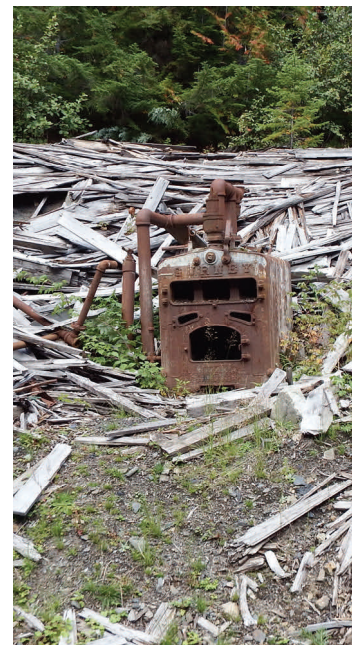
Old boiler in the town debris.

"Other trails around Sandon will beckon you to follow them. We simply ran out of time and could have easily stayed and explored lots more"