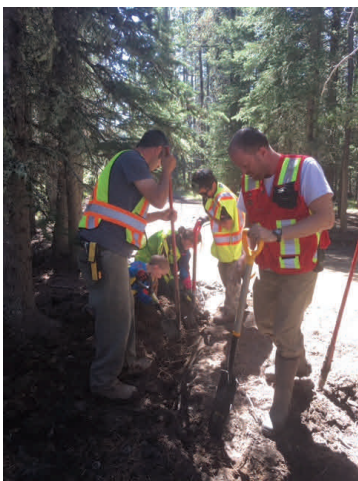
Draining holes and trail repair.