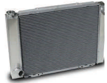
What your radiator should look like when it is clean.

The best advice I can give is clean your radiator front and back using a high pressure washer after each ride ensuring the water runs clean. Carry a "Radblaster", pump or something you can use to clean your radiator with when you are close to water a water source. Radblaster's are a great item to have on your ATV or UTV. They can be used in the shallowest puddle of water and the pressure they produce is equal to the force you use. Check your radiator often and if others are cleaning their radiator it might be a good idea to clean yours as well. If you like to play in the mud clean it often or have it relocated. Most important is to never drive your ATV if it is overheating. Stop until it cools down and if possible clean your radiator. Reminder: be respectful when cleaning your radiator. Never drive your ATV or UTV up and down creeks or riverbeds..