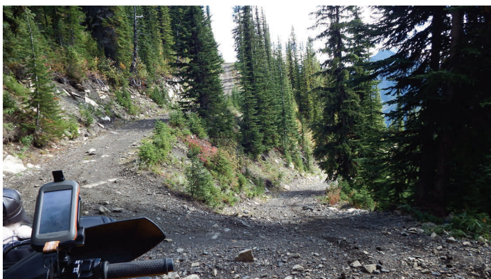
Bottom left: One of the many hairpins.