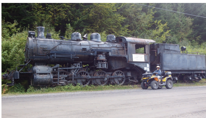
Bottom right: Old locomotive in downtown Sandon.