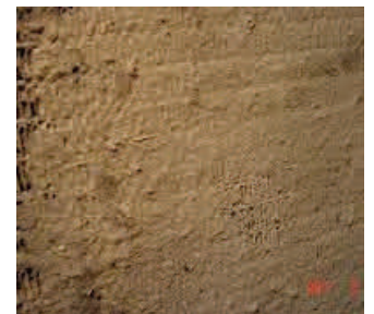
What your radiator looks like when it is filled with mud.