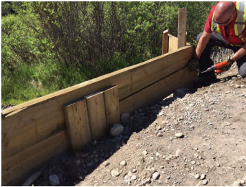
Wing wall repair.