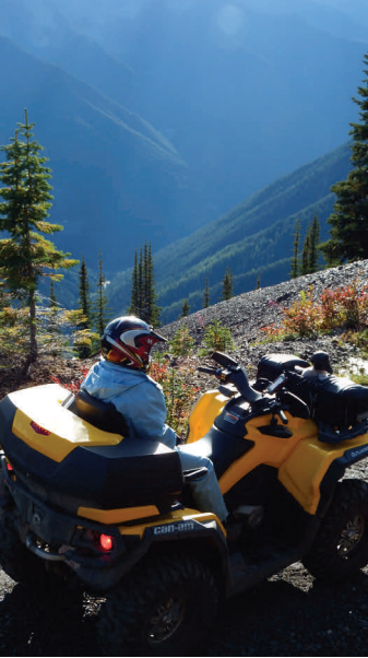
Sandon, far below.

"ride along paths that vary from well-maintained forest service roads (FSRs) to narrow, cliff hugging trails that are barely wider than your machine"