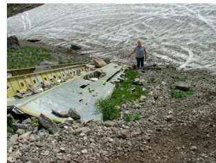
Some of The wreckage strewn around the area