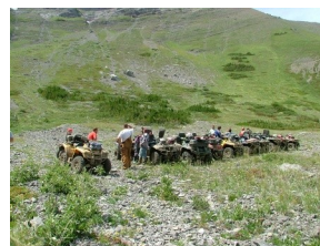
More scenery from the CNP area