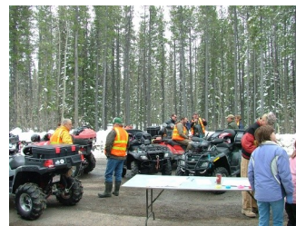
Getting Ready to go

If you haven't been on a club ride yet, please join in. You will be glad you did.