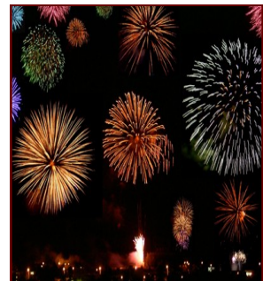
Fireworks display at Thunder in the Valley