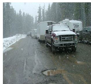
Just a bit of snow