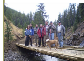
The bridge crews on the Hunter Valley Bridge build