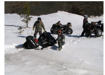
Stuck On Quirk Ridge

or out with the volunteers building bridges.