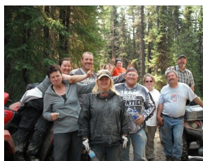
Everybody in with the 2 fingers

Our support has grown to the Provincial level where 2 board members of CARA are now on the executive board of the AOHVA. We look forward to working closely with the AOHVA to provide a unified voice on our trail issues.