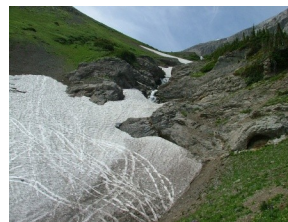
Towards the end of July and still lots of snow