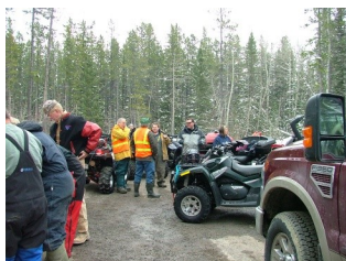
Check in for the ride.