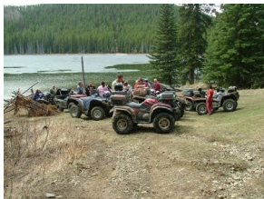
Group picture May Long Weekend ride to Cow Lake