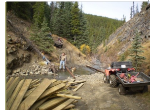
Hunter Valley Bridge build

to quadsquad@nucleus.com or contact one of the CQS directors if you're interested in one of these opportunities. Position details are available in the February 07 newsletter. Your assistance to improve the club and help to reduce volunteer stress and burnout is appreciated!