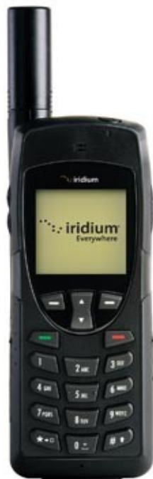
Iridium 9555 Satellite Phone