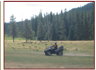
On the trail near Waiparous