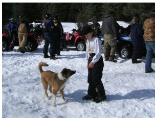
Taffy The Quad Dog