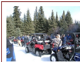
Having Lunch South East corner McLean Creek