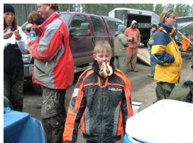
Mmmm Good hot dogs