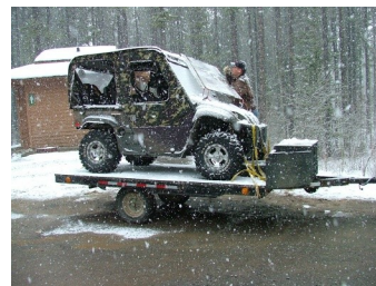
Hmmm a Bit of snow while loading up