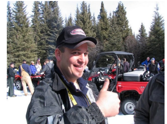
Thumbs Up From MudBob

It was the kind of day that makes a person feel great to be alive in this fine province and to be able to enjoy such great camaraderie, scenery, and adventure, only an hour from Calgary.